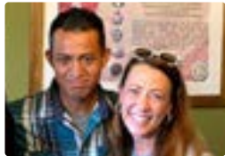
PARENT PARTNER RELATIONSHIP