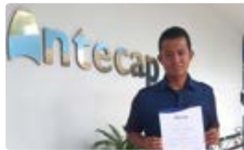
NEXT STEPS STUDENT