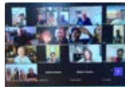
MONTHLY FELLOWSHIP CALLS