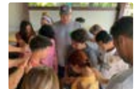
TEAM TRIP ENCOURAGEMENT