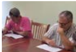
DISCIPLESHIP PASTOR MENTORING