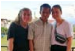
SSM STAFF SUPPORT