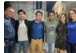
DISCIPLESHIP BIBLE STUDIES & ACTIVITIES